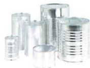
Aluminum & Tin Cans